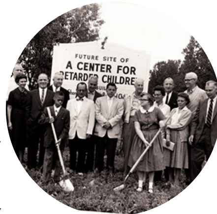
Shore School circa 1959

Shore's mission is to improve the quality of life for persons with intellectual and other developmental disabilities through educational, residential, vocational and related programs provided with community integrated supports and services.