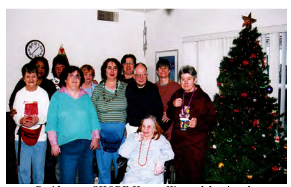
Residents at SHORE Homes West celebrating the holidays during an Open House in December 2005.