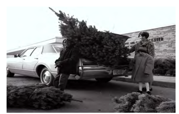
Christmas trees were sold at SHORE School for decades, which became a family tradition for many living in the north shore area.