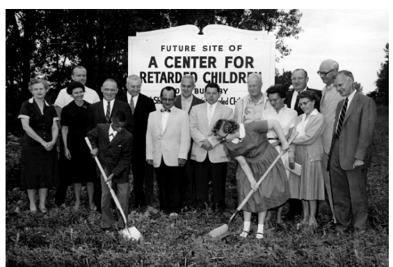
Groundbreaking for the future SHORE School at 2525 Church Street in Evanston on August 5, 1961.