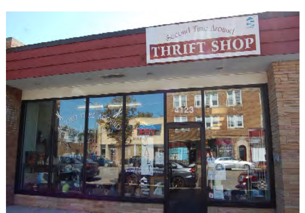
Second Time Around Thrift and Gift Shop 4123 Oakton Street in Skokie.