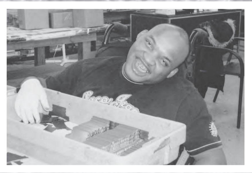
A trainee stacks die-cut metal parts for a company called Sko-Die, Inc.