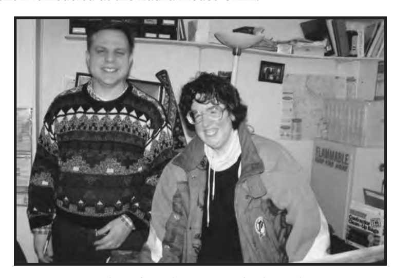
Residents from the Patricia Lloyd Townhomes.