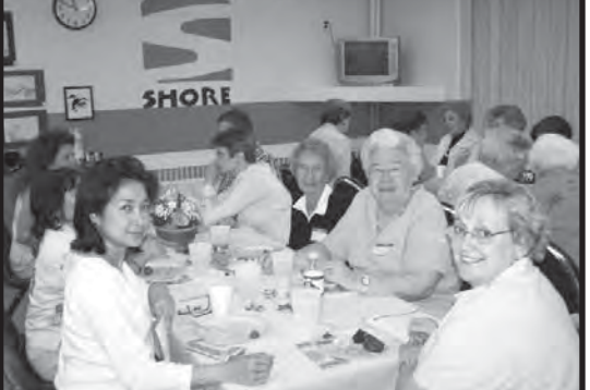
Volunteers from SHORE's re-sale shop at a luncheon that honored their service to the agency.

Second Time Around Thrift & Gift Shop, 4123 Oakton Street in Skokie.