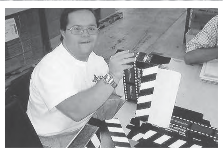
A trainee works on assembling boxes for an ad specialty company.