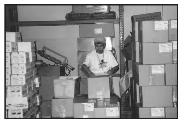
A\ trainee\ is\ busy\ packaging\ sanding\ blocks\ for\ Trim\mbox{-}Tex\ Inc.