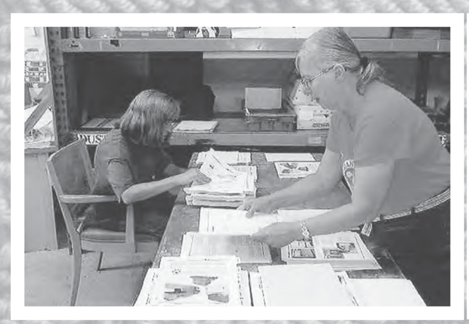
Trainees working on a hand collating job for K & L Looseleaf Co.