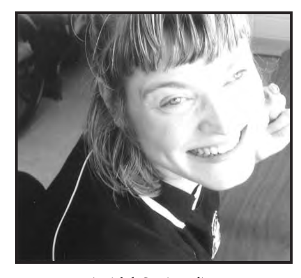
An Adult Services client.