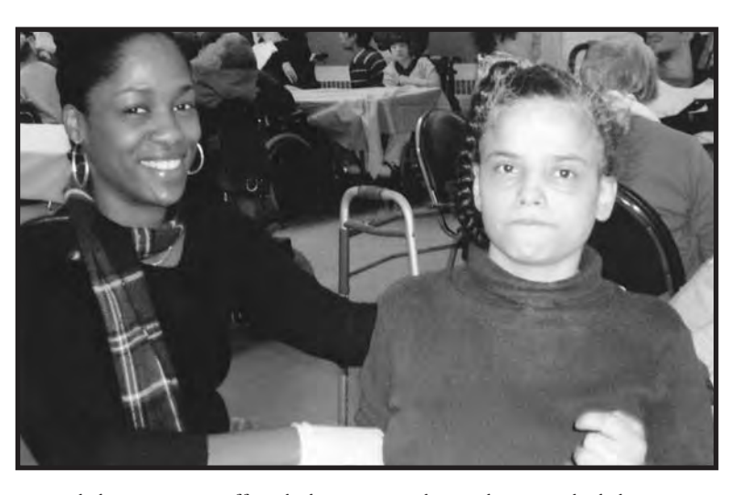
An Adult Services staff and client enjoy themselves at a holiday party.