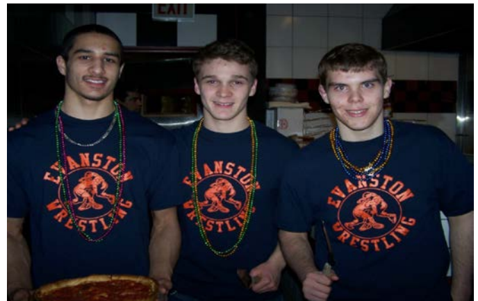
Volunteers from Evanston Township High School’s Wrestling Team stop for a photo while serving pizza and soft drinks to the hungry crowd at Pizzamania.