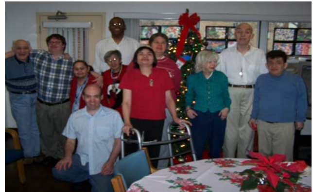
Residents from Buehler House-SHORE Homes East.