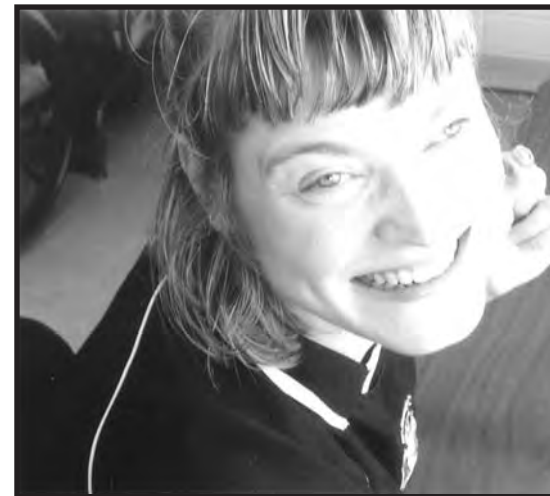
An Adult Services client.