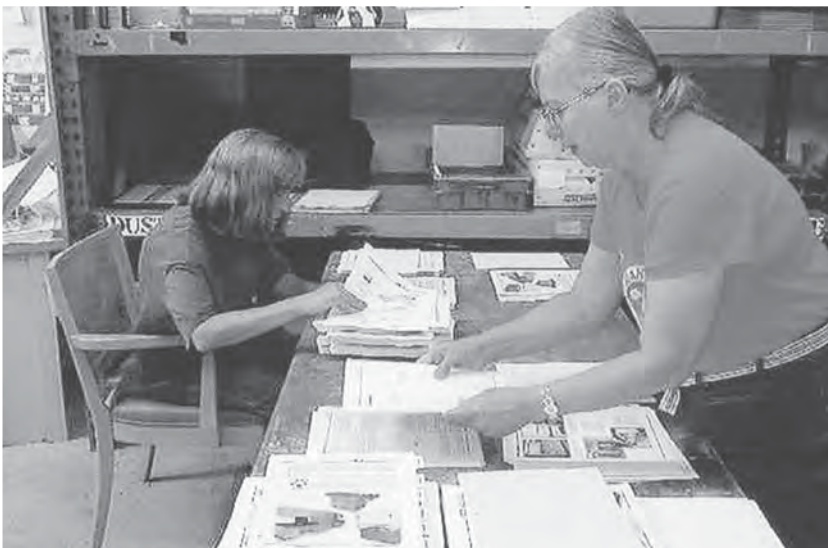
Trainees working on a hand collating job for K & L Looseleaf Co.