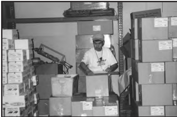
A trainee is busy packaging sanding blocks for Trim-Tex Inc.