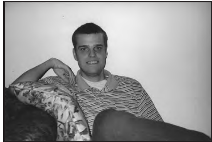
A resident is all smiles while relaxing at home.

Five two-story homes comprise the Patricia Lloyd Townhomes available to adults who can live independently. Twelve residents live in the homes and most are employed in the community. Residents take responsibility for themselves and their living unit. House Managers reside in one apartment to provide support and intervention on an individualized need basis.