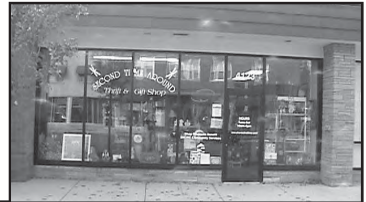
Second Time Around Thrift & Gift Shop, 4123 Oakton Street in Skokie.

14th Annual Golf Outing Deerfield Golf Club Friday, July 18, 2008