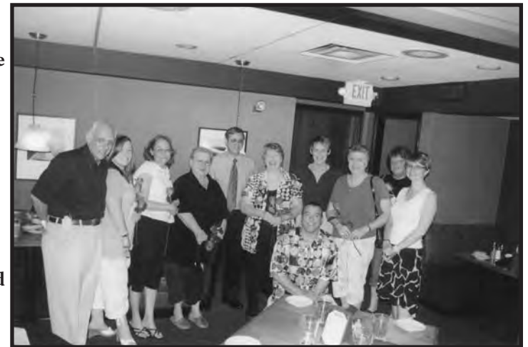
Some of the staff members with ten or more years of service at SHORE.