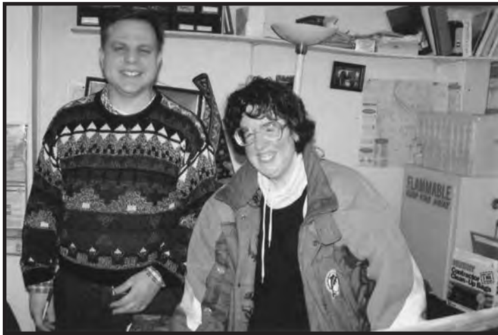
Residents from the Patricia Lloyd Townhomes.