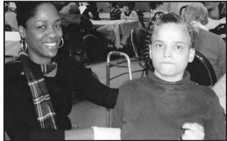
An Adult Services staff and client enjoy themselves at a holiday party.