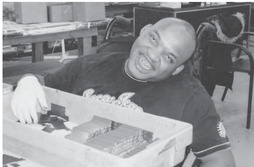
A trainee stacks die-cut metal parts for a company called Sko-Die, Inc.