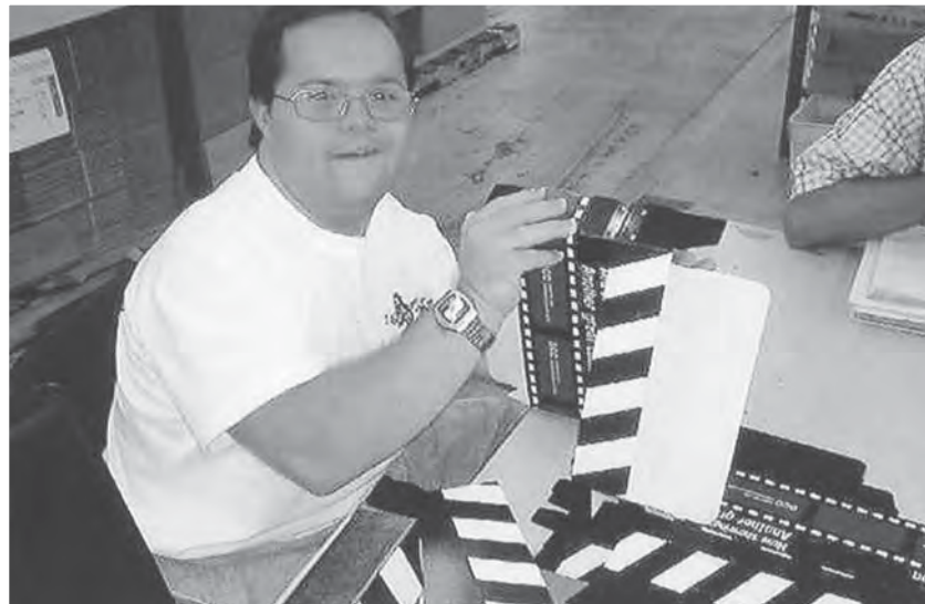
A trainee works on assembling boxes for an ad specialty company.