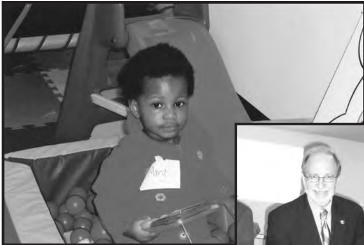
A child playing in the balls during a play group at SHORE Early Intervention Center.