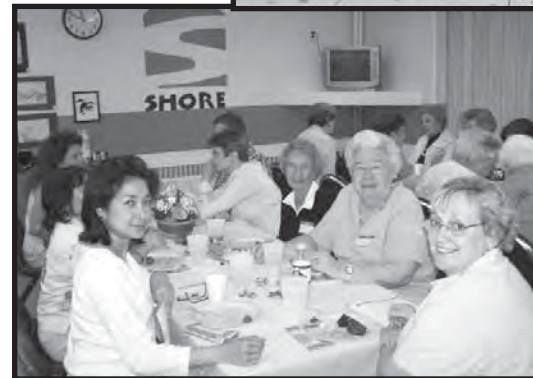
Volunteers from SHORE's re-sale shop at a luncheon that honored their service to the agency.