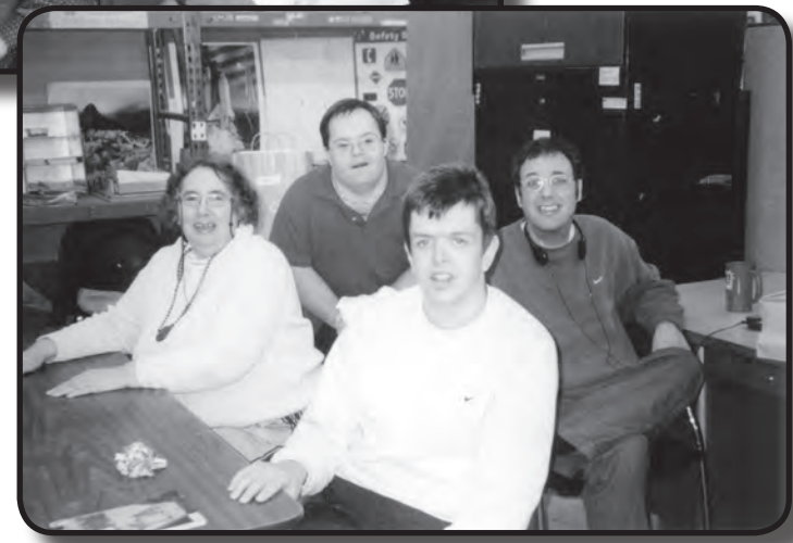
Trainees at SHORE Training Center take a break for a picture.