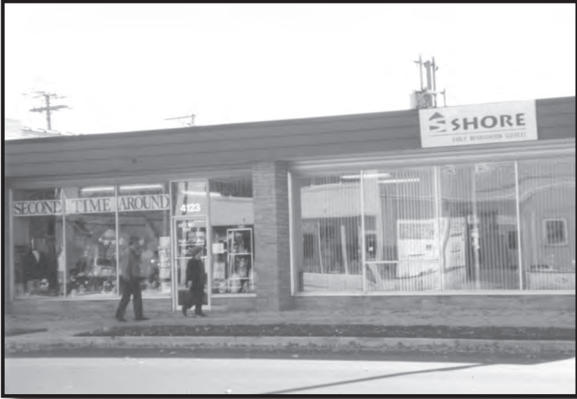
SHORE's new Early Intervention (EI) site and agency re-sale shop, Second Time Around Thrift and Gift Shop, at 4123-25 Oakton Street in Skokie.